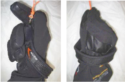
Fig. 4: Recommendation: hand looped through the brake handle

The control handles on the Spitfire 2 PLUS are made of a strap padded with neoprene. The best way to hold them is shown in the photo. In this way, they are ideally adjusted for the Spitfire 2. For safety reasons, we generally recommend that you loop your hands through the brake handles.