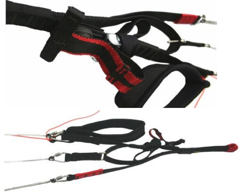
Fig. 3 Trimmer open