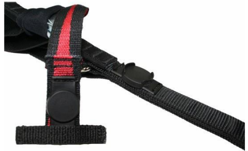
Fig 1 Trimmer

stop the trimmer webbing from flapping, as it can then be secured.