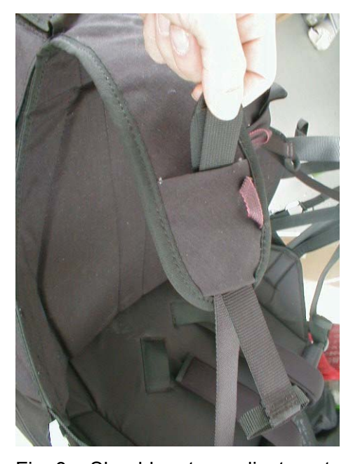
Fig. 3 – Shoulder strap adjustment

Adjusting the shoulder straps allows the harness to be altered according to the height of the pilot. This is done using the adjustment straps integrated in the shoulder padding.