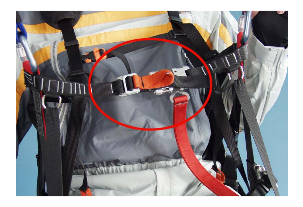
Fig. 4 – Chest piece adjustment/ Hangpoint distance