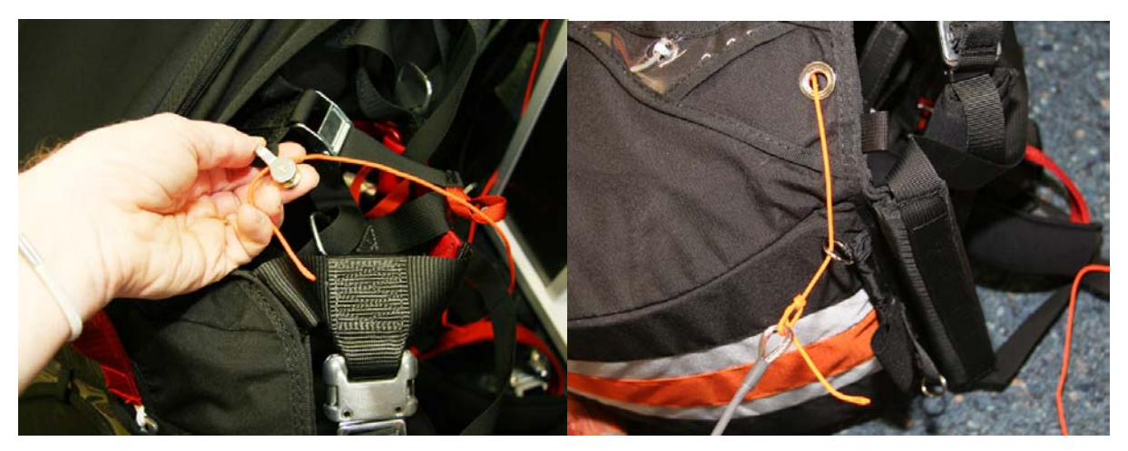
Fig. 1 – speed bar line through pulley

<u>CAUTION – RISK OF ACCIDENT:</u> Before you make your first flight, check the adjustment of the speed system on a suitable training slope. Never launch if the speed bar is too short. If it is, there is increased danger because the trim angle is reduced, causing the glider to be accelerated. This cannot be rectified during flight, since the speed system cords are under tension.