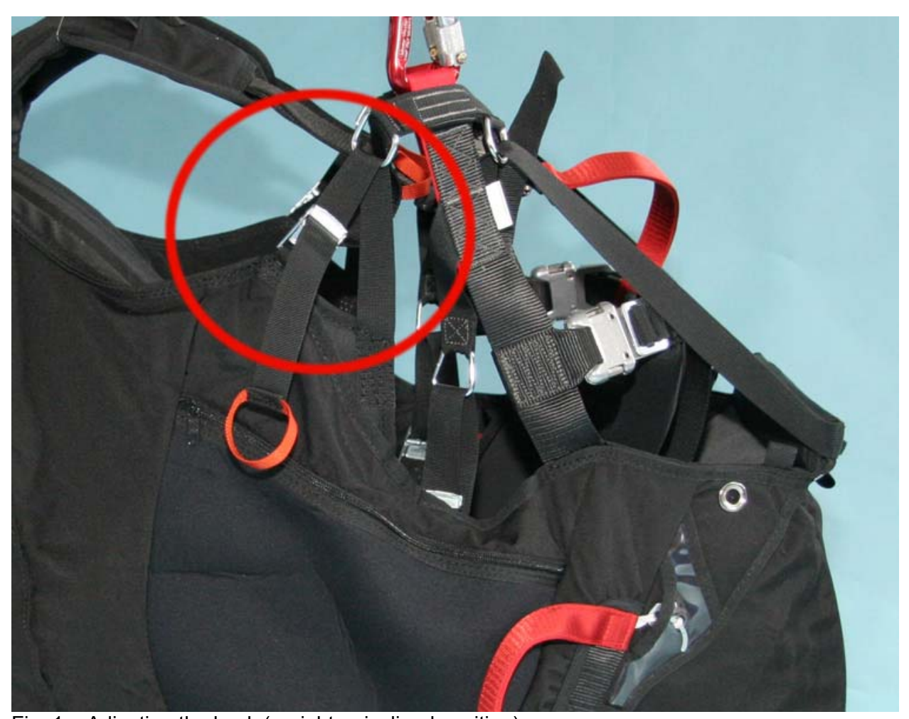
Fig. 1 – Adjusting the back (upright or inclined position)

The first adjustment is to the seating position and size of the harness. The seating position is adjusted by the opening angle of the harness. Decide the angle at which you want to sit (angle between back and thigh - upright or inclined position). The angle of adjustment ranges from approx. 70° to 100°. The adjustment is made using the side buckles (Fig. 1) which you will find at about chest height. If the harness is shortened here, the seating angle will be smaller (upright position); if it is lengthened, the seating angle increases (inclined position).