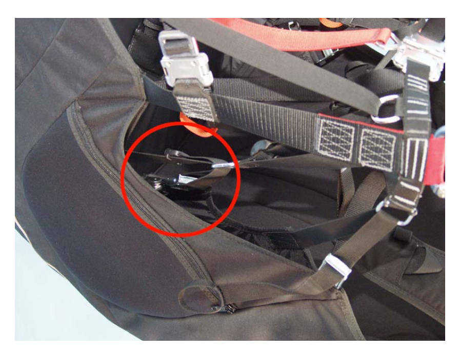
Fig. 2 – Seat angle adjustment / Seat depth

The second adjustment is to the angle of the seat, whereby you can decide how "deep" you wish to sit in the harness. A comfortable seating position should be chosen which is suitable for the size of the pilot, so that no further adjustments need to made during flight.