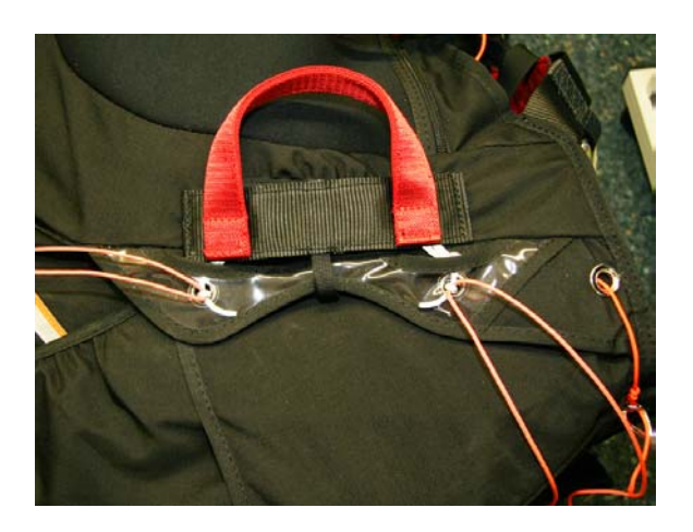
Fig. 1 Fig. 2