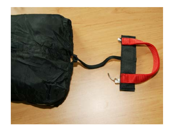
3.1.2 Fitting the reserve system

The reserve system is fitted in the outside container of the CONNECT 2 as follows. Note the <u>side</u> attachment of the rescue bridle loop.