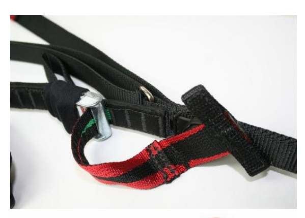
Fig. 5 Trimmer closed

Never fly with trimmers fully open in turbulent conditions!