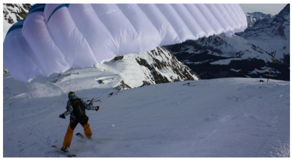
Fig. 8 Ueli Kestenholz launches with the brakes applied only about 30%