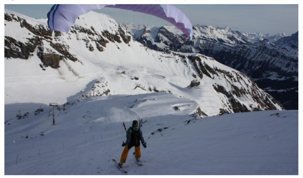
Fig. 9 Slowing down while controlling your wing

Brake the MIRAGE RS PLUS briefly and strongly as soon as it is above you, to prevent it shooting forward. While you are doing this, you can carry out the essential safety check of the glider. The MIRAGE RS PLUS has relatively long lines, which can cause it to build up a lot of energy during launch and it may want to overtake the pilot or swerve more strongly to the side.