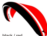
black / red