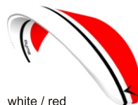
white / red