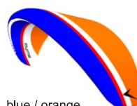
blue / orange