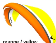
orange / yellow