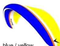
blue / yellow