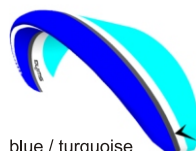
blue / turquoise