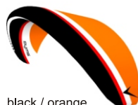
black / orange