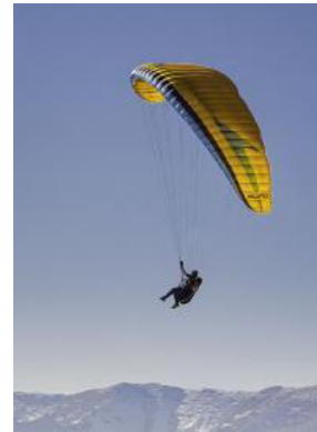
BEHAVIOUR AT MIN WEIGHT IN FLIGHT (65KG)

Type designation SWING Mito 2 RS S Type test reference no DHV GS-01-2674-22 Holder of certification Swing Flugsportgeräte GmbH Manufacturer Swing Flugsportgeräte GmbH Classification A Winch towing Yes Number of seats min / max 1 / 1 Accelerator Yes Trimmers No