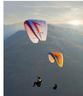
BEHAVIOUR AT MIN WEIGHT IN FLIGHT (85KG)

Type designation SWING Serac RS ML Type test reference no DHV GS-01-2709-22 Holder of certification Swing Flugsportgeräte GmbH Manufacturer Swing Flugsportgeräte GmbH Classification B Winch towing Yes Number of seats min / max 1 / 1 Accelerator Yes Trimmers No